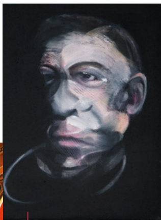
1990, Francis Bacon, Portrait of Jacques Dupin